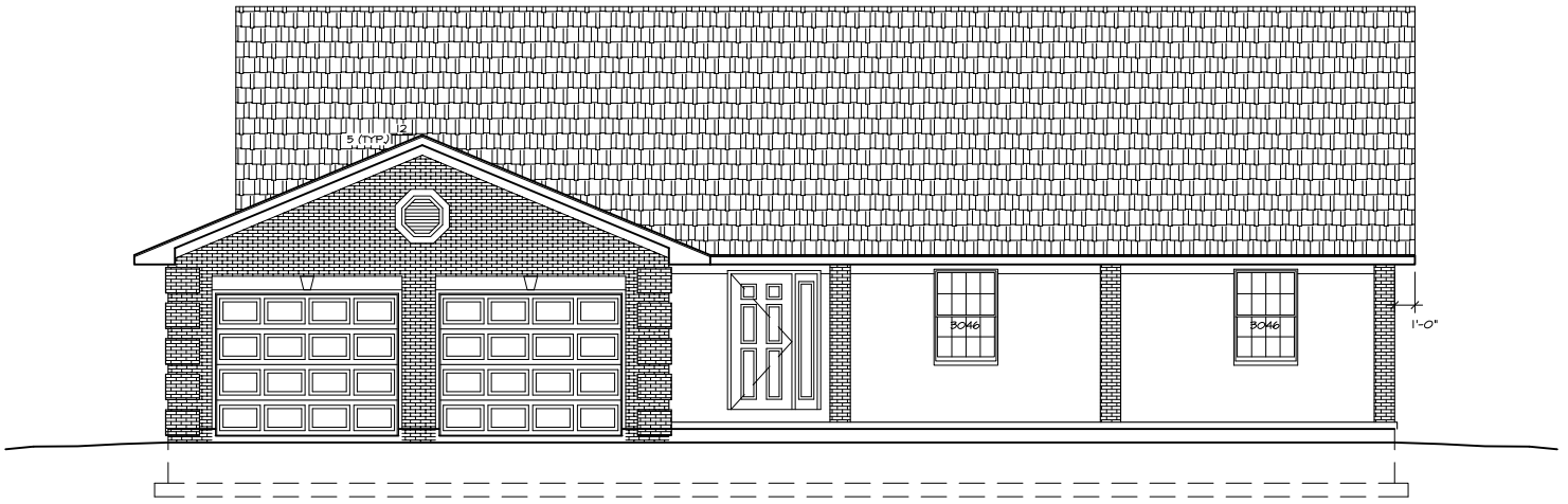
FRONT ELEVATION A-1